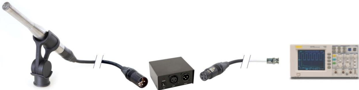
Phantom Powered Microphone System

The phantom powered preamp may be used with either a 1/4" or a 1/2" microphone cartridge by using the adapter provided. All IEC 61094-4 compliant microphones can be used with the phantom powered preamp.