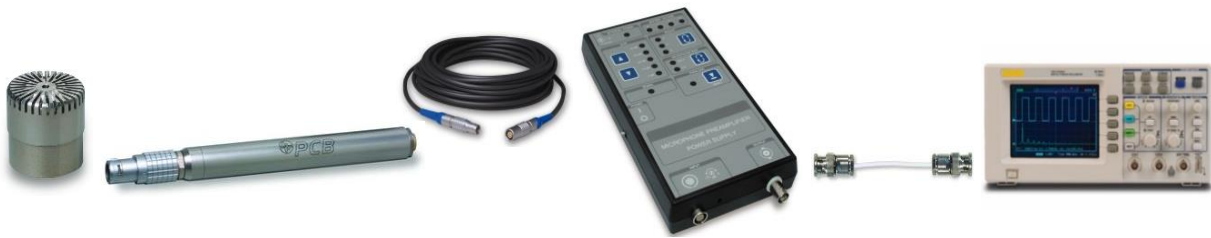
Externally Polarized Microphone System

Phantom powered microphone systems use a 3 pin XLR connector. A phantom powered microphone system should use a 48V phantom power supply or signal conditioner for optimum performance; however these microphone systems may be powered with a 24V or a 12V phantom power supply, but this will limit the maximum output voltage.