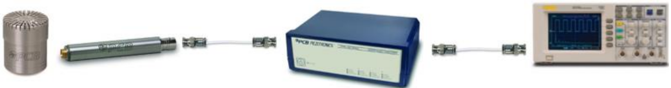
Prepolarized Microphone System