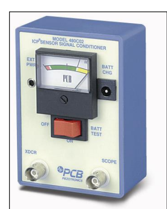
Figure 14 – Battery Powered Signal Conditioner

Power supply/signal conditioner (Model 480C02) is for use with the Smart Switch when determining the alarm threshold level using the MAVT<sup>™</sup> feature. The built-in meter indicates when the process is complete. See www.pcb.com for product details.