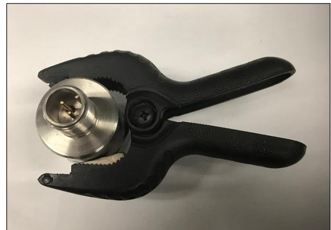
Figure 13 – Magnet Clip

Note: The magnet clip (Model 080A214) is a supplied accessory.