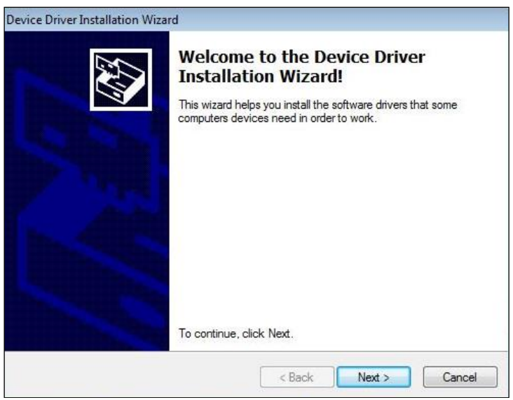
Figure 5 – WinUSB Driver Installation Screen

The drivers will now be properly installed and you should get the following screen. Click "Finish". The software is now ready to use.