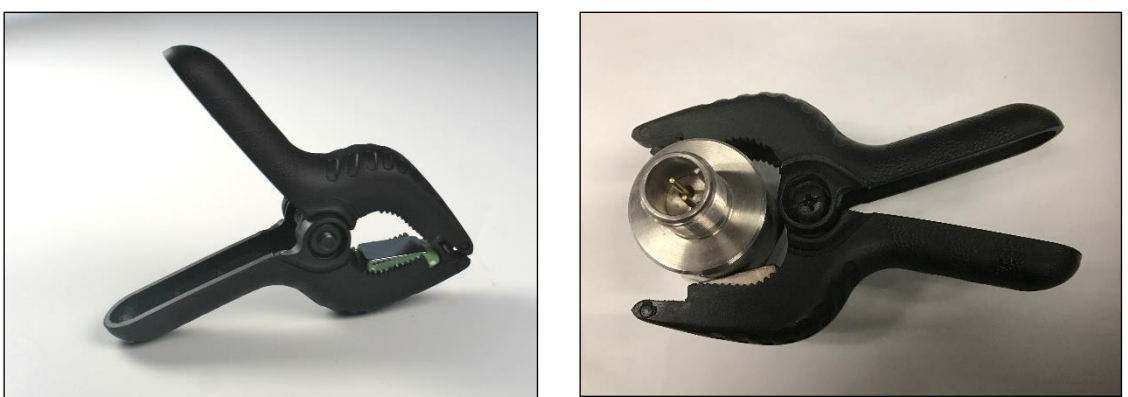
Figures 16 and 17 – Magnet Clip with and without Smart Switch

The magnet clip (Model 080A214) is supplied as part of the 600A29 USB Programmer Kit and can be ordered separately for use with the MAVT<sup>™</sup>.