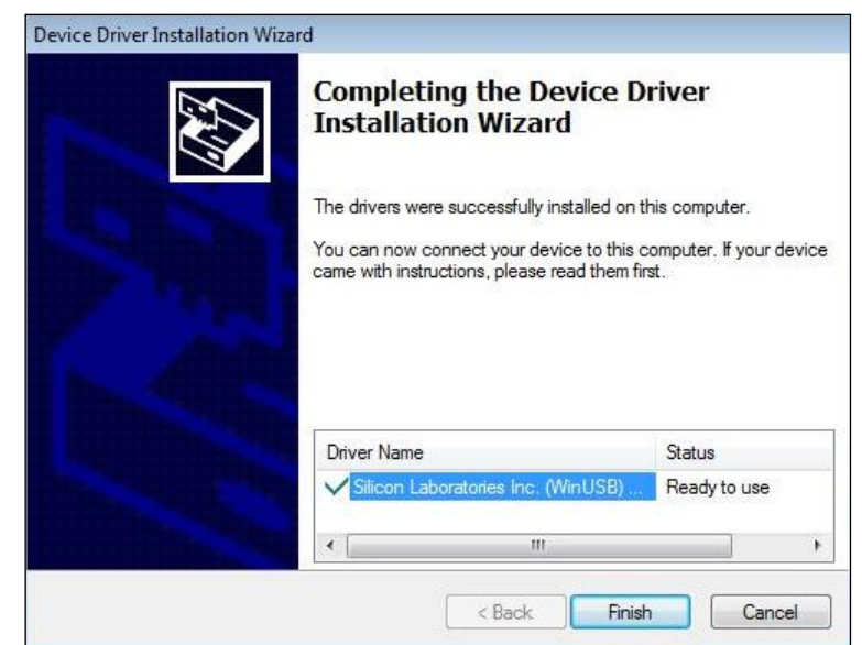
Figure 6 – WinUSB Driver Installation Complete Screen

The drivers will now be properly installed and you should get the following screen. Click "Finish". The software is now ready to use.